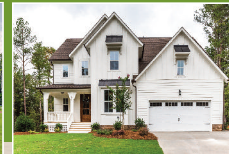
1st Floor Masters