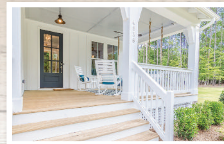
DECORATED MODEL HOME OPEN DAILY

Located right across the street from Glen Creek, SOUTH GARNER HIGH SCHOOL Please confirm schools with the Wake County Public School System http://www.wcpss.net