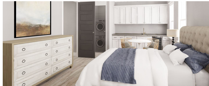
In-Law Suites to Support Multi-Generational Living