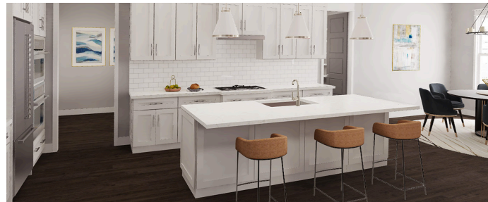
State of the Art Scullery Kitchen Options