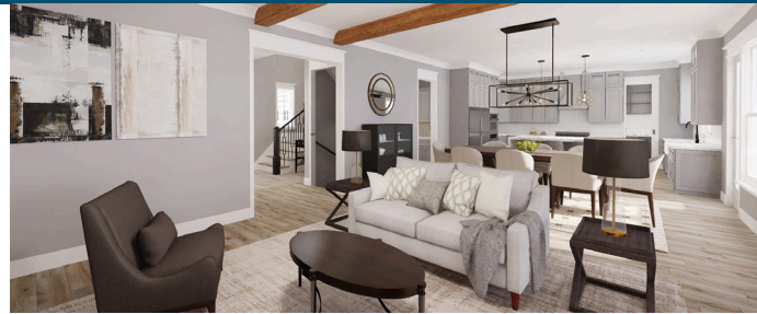
New Luxury Floor Plans

Large, Wooded Homesites (1.5 - 8.5+ Acres) featuring 5 new, luxury floor plans with 15 exterior designs to ensure a beautiful and diverse streetscape